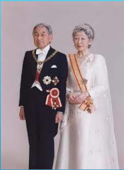
Emperor Emeritus Akihito Abdicated in October 2019