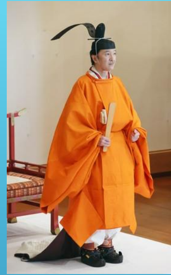
Crown Prince Fumihito: Second Son of the Emperor Emeritus