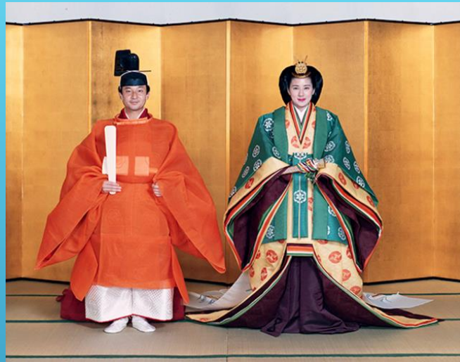
Emperor Naruhito: 126 th Emperor