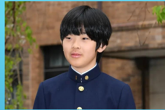
Prince Hisahito: Son of the Crown Prince Fumihito

According to Imperial House Law, only male-line male prince in Imperial family can succeed the Imperial Throne. Crown Prince Fumihito, Second Son of the Emperor Emeritus and younger brother of The Emperor Naruhito will succeed the next Imperial Throne and son of the Crown Prince, Prince Hisahito will be next.